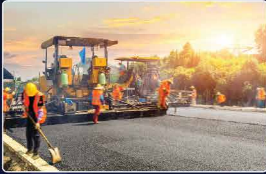
Airoli - Katai Naka Road