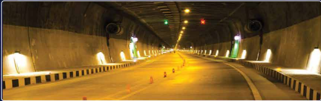
Thane - Borivali Twin Tunnel Project