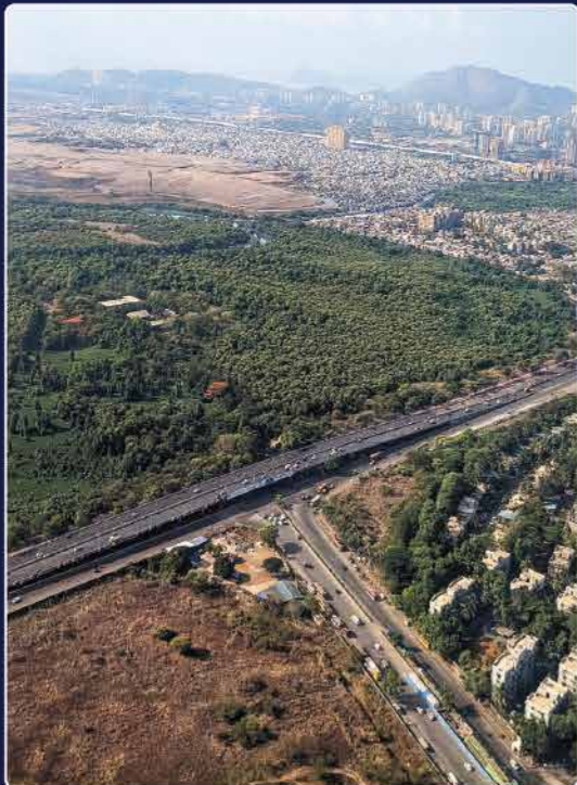
Eastern Freeway Extension Till Thane