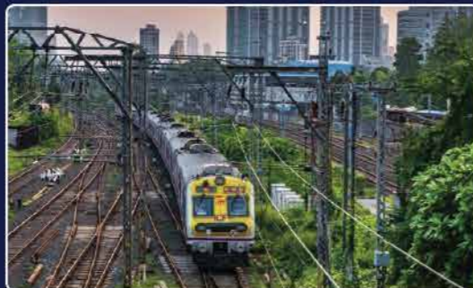
New Thane Railway Station