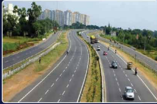
Thane Coastal Road & Wadala - Anand Nagar Freeway Extension