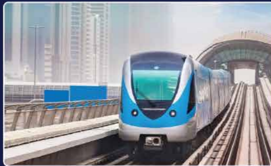
Metro Line - 4 & 5